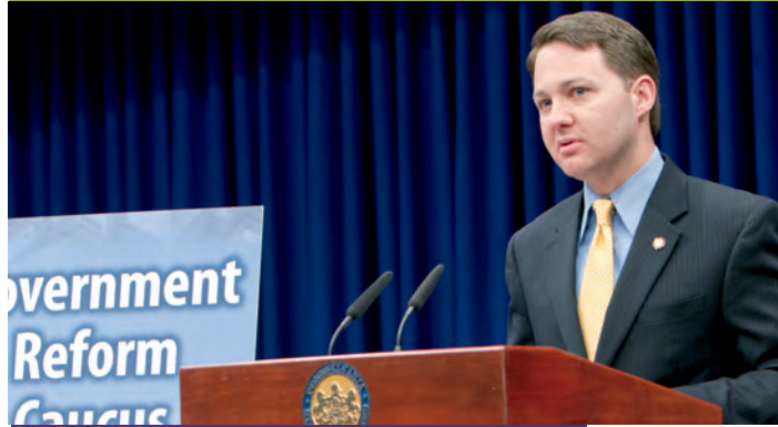
Sen. Teplitz announces the creation of the Government Reform Caucus during a March 18 news conference at the Capitol.